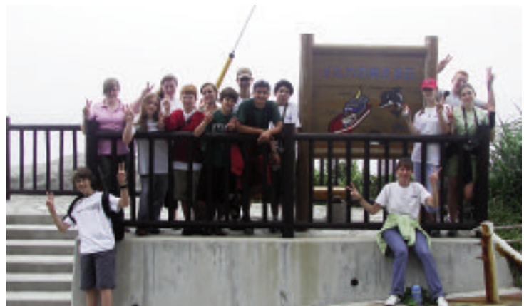
At the top of the hill after our arrival on Mikura ... at the dolphin watching spot.