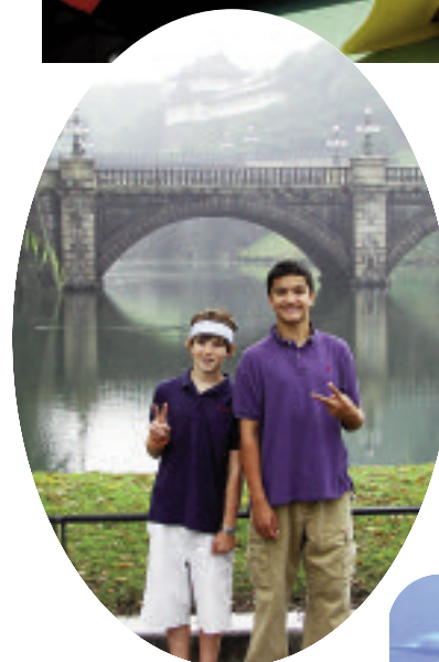
At the Imperial Palace

The Dolphin Gazette is now printed on 100% recycled paper!