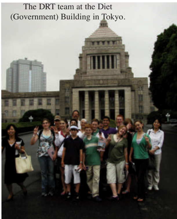
The DRT team at the Diet (Government) Building in Tokyo.