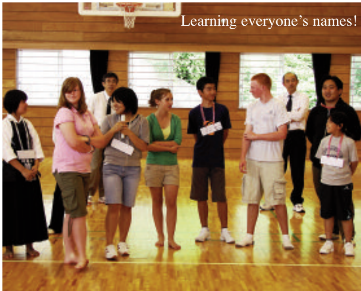
Learning everyone's names!