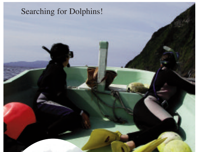
Searching for Dolphins!